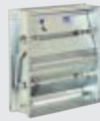
63-2598 Specification Data