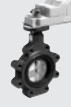
63-1287 Specification Data